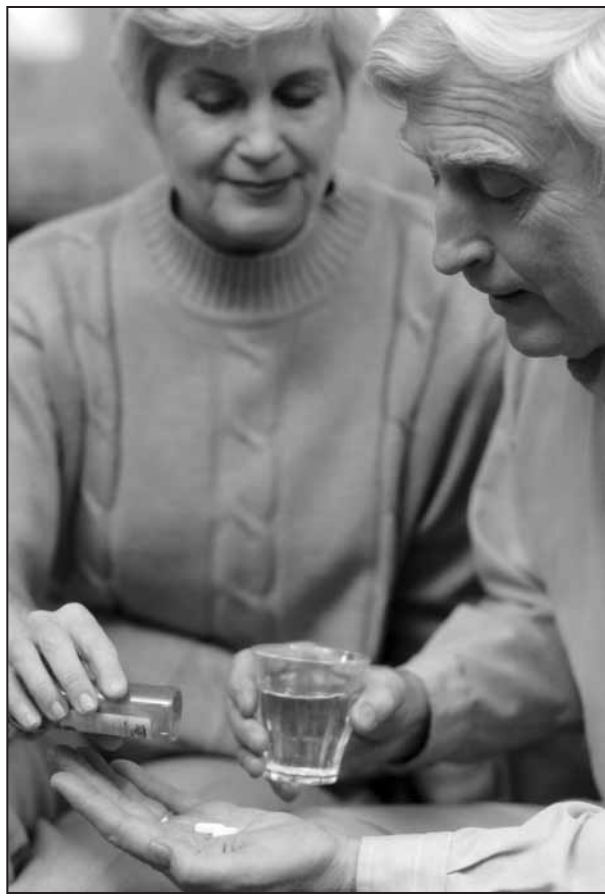
For many spouses, administering medications to loved ones becomes a responsibility after the onset of MCI.