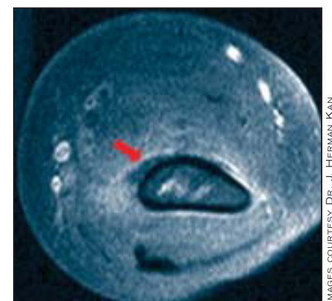
Corresponding T1-weighted image of the distal humerus, shown above.

The findings suggest that musculoskeletal MRI "plays an important role in the management of these patients because of its ability to evaluate underlying osteomyelitis despite recent intervention," according to the authors. With correct clinical and surgical history, they wrote, "patterns of soft-tissue and marrow edema can be explained."