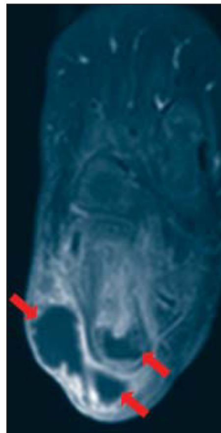
Right foot after IV administration of gadolinium shows large soft-tissue abscess (arrows) and intraosseous calcaneal abscess (arrowhead).

A total of nine patients had a final diagnosis of osteomyelitis, and "objective MRI criteria were present in all nine patients," the authors wrote, while none of the remaining 25 patients had characteristic imaging features of osteomyelitis. Among the patients with an osteomyelitis diagnosis, "eight of nine had one or more imaging criteria of osteomyelitis, including intraosseous abscess, cortical breach, or subperiosteal abscess," they said. The ninth subject was diagnosed with acetabular osteomyelitis based on evidence of marrow and soft-tissue edema in the obturator internus muscle, away from the intervention site.