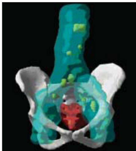
Positive lymph nodes are shown in green on the FDG-PET scan.

The protocol delivered a clinical target volume-nodal of 50 Gy over 30 fractions to the pelvis and para-aortic lymph node regions, along with a molecular target