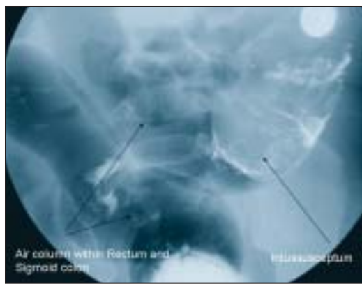
A combination contrast and air enema shows intussusception in the lumen.