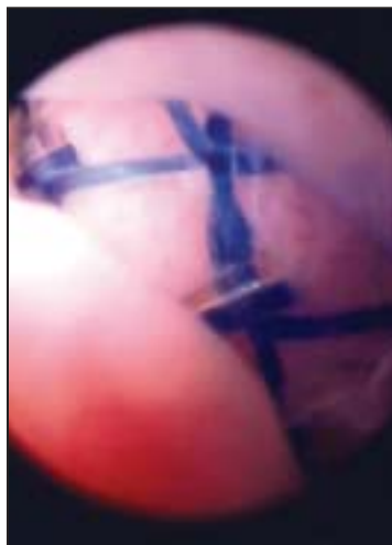
Tension-free vaginal tape mesh is shown in the urethra.