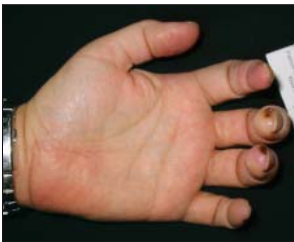
Bosentan blocks dual endothelin receptors, thereby preventing digital ulcers in patients with scleroderma.