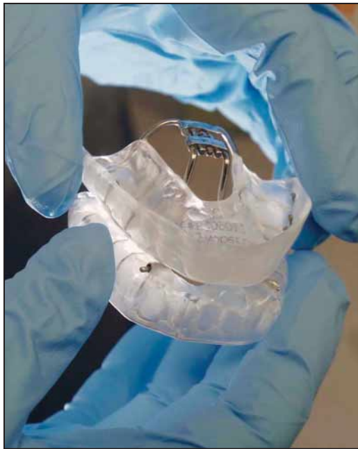
Data show that an oral appliance may be more effective than surgery for sleep apnea.

For patients who don't have the teeth or bone structure needed to anchor the mandibular devices, tongue-retaining appliances can be used to pull the tongue forward and expand the airway at the base of the tongue. "You'd be shocked at the number of