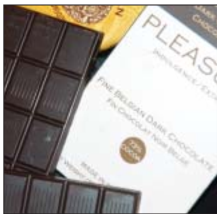
Study participants ate 6.3 g daily, or 1 piece of a 16-piece bar.

The investigators studied chocolate’s effect in 20 men and 24 women aged 55-75 years who were in good general health, except for having prehypertension (blood pressure of 130/85 to