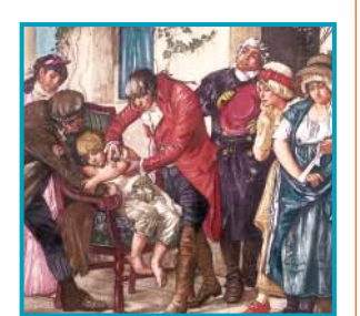
Jenner vaccinates James Phipps, 14 May 1796.

Over 200 years ago, Edward Jenner changed the landscape of disease prevention by demonstrating the effectiveness and safety of the first attenuated live vaccine. Since then, vaccines based on the same principle have been