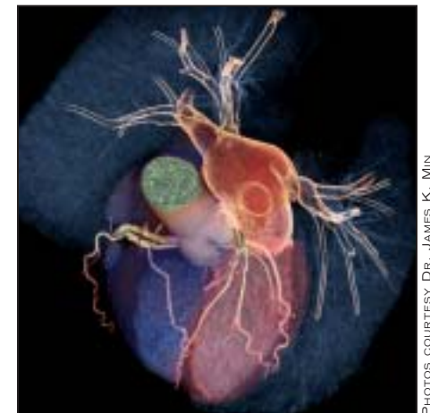
Here, a multidetector CT volume rendered image shows calcification in the left anterior descending and right coronary arteries.

outcomes. Patients who underwent initial SPECT imaging had a higher rate of surgical or percutaneous interventions in the follow-up period compared with those who had CTA—1.2% compared with 0.4%, respectively.