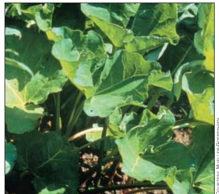
An extract derived from the roots of Rheum rhaponticum , shown here, has been on the market in Europe since 1993.

The compound was safe and was associated with no breast tenderness or increase in endometrial thickness as assessed on ultrasound and biopsies, no changes in liver enzymes, no changes in blood pressure, no changes in weight, no increase in