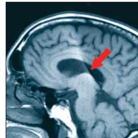
Operator errors caused more than half of all deep brain stimulation failures. Shown are DBS lead misplacements in the ventricle (left) and atop the thalamus (right).