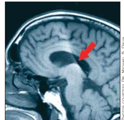
Operator errors caused more than half of all deep brain stimulation failures. Shown are DBS lead misplacements in the ventricle (left) and atop the thalamus (right).