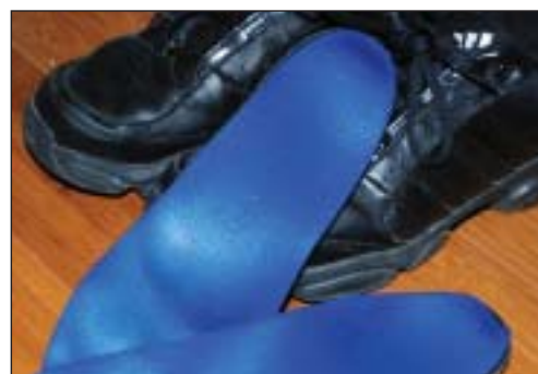
Researchers found data supporting the benefit of custom foot orthotics for some.

► Plantar fasciitis. A study of 92 subjects assessed at 3 and 12 months demonstrated a statistically significant improvement in foot-pain related function for those who used custom orthotics to treat plantar fasciitis, compared with those using sham orthoses. Treated subjects reported a weighted mean improvement of 10.4 at both time points on the foot health