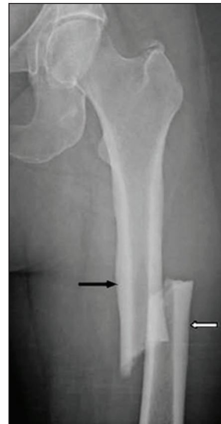
This anterior-posterior radiograph of the left femur demonstrates a substantially transverse femoral fracture and associated diffuse periosteal new bone formation (black arrow) and focal cortical thickening (white arrow), consistent with atypical femoral shaft fracture.

The task force report is available at www.jbmr.org/details/journalArticle/843323/Atypical_subtrochanteric_and_diaphyseal_femoral_fractures_Report_of_a_task_force.html . Serious adverse events associated with bisphosphonates should be reported to the FDA’s MedWatch program at 800-332-1088 or www.fda.gov/medwatch .