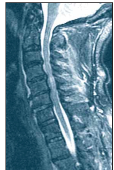
MRI, 36 hours later, shows injuries and cord contusion.