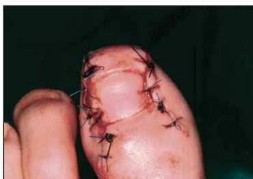
The breadth of the toe is clearly reduced but the nail apparatus is preserved.