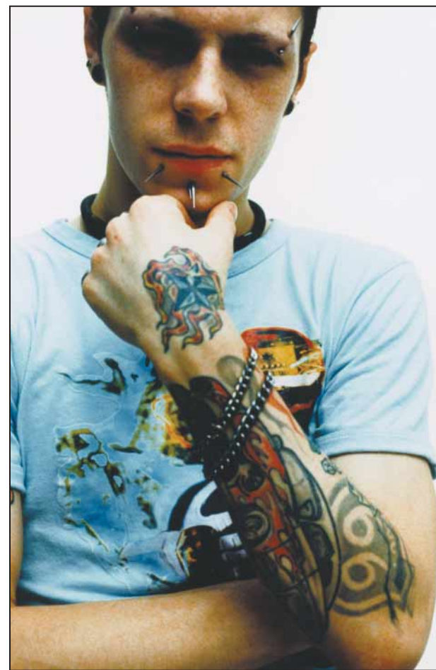
Individuals who undergo body modification have a high rate of self-reported prior suicide attempts.

‘I would have predicted a lesser association with suicidality, given how much more popular tattoos have become since several decades ago.’