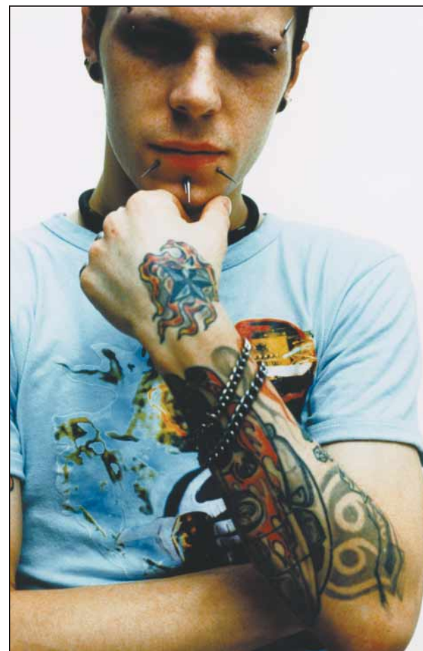
Individuals who undergo body modification have a high rate of self-reported prior suicide attempts.

‘I would have predicted a lesser association with suicidality, given how much more popular tattoos have become since several decades ago.’