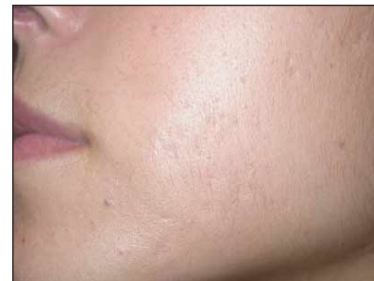
Her acne responded to 8 months of flutamide 125 mg/day plus oral contraceptives.