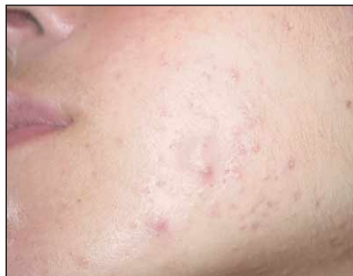
This patient's acne was refractory to treatment with isotretinoin.