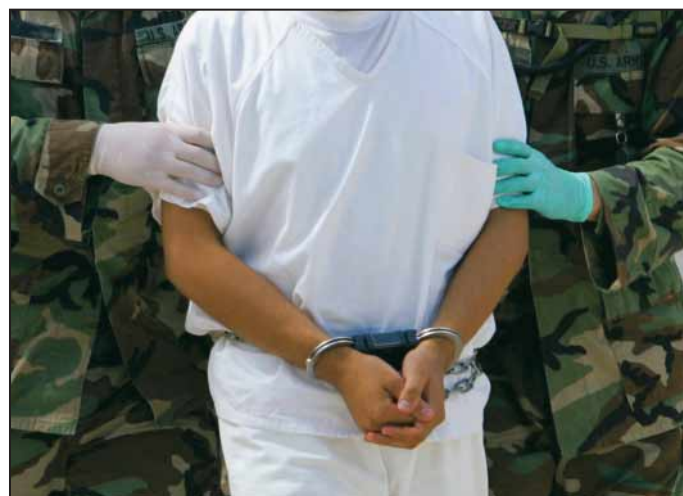
Mental health professionals reportedly have been involved in developing individualized interrogation plans for detainees.

Representatives from several key APA committees will meet this month to come up with a proposed position. That proposal will then go through a formal chain of approvals, including the APA assembly