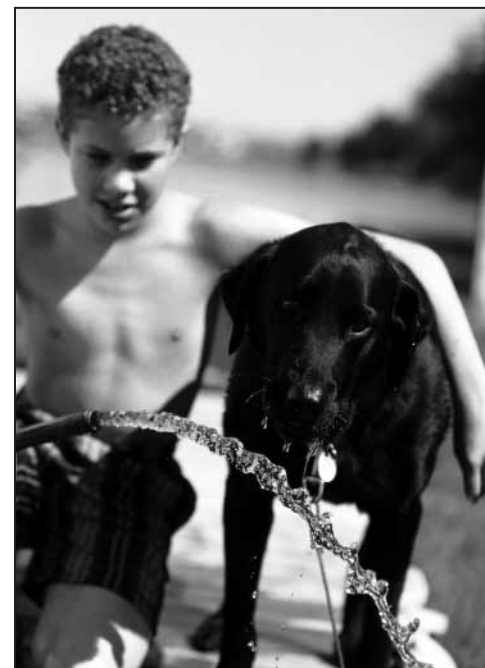
Not all pets have to be banished from the home, but vigilant care is necessary.

prophylaxis is difficult, she said, as there are no direct data for children with splenectomies. Physicians should discuss the risks and benefits with their patients. The recommended dosages are 125 mg of penicillin V twice daily in children under age 5 and 250 mg twice daily in children over age 5; some experts use amoxicillin (20 mg/kg daily).