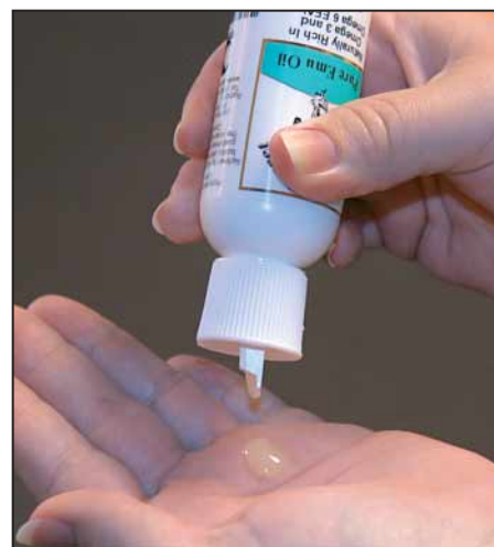
Emu oil reduced pain 2.34 times better than placebo in a double-blind trial.

As early as 1860, naturalists reported that Australian aborigines and early Anglo settlers used emu oil to treat wounds and relieve musculoskeletal pain, she added. ■