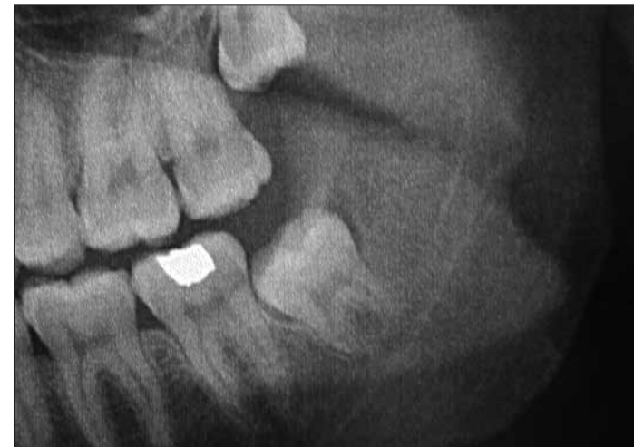
This x-ray shows an impacted healthy third molar crowding second molar, which can lead to early periodontal disease.

"Just because you have no symptoms doesn't mean that you have no problem. What we're recommending is that everybody with wisdom teeth should have them evaluated. Twenty percent or maybe 25% of people can keep their wisdom teeth with no problems, but you can't ignore them. They need to be evaluated seriously," he added.