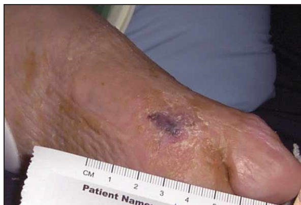
The wound has healed 6 weeks following a successful course of “biological debridement.”