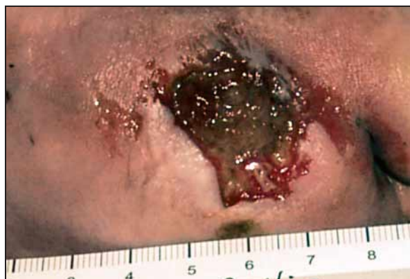
This photo shows “a clean wound” soon after completion of the treatment.