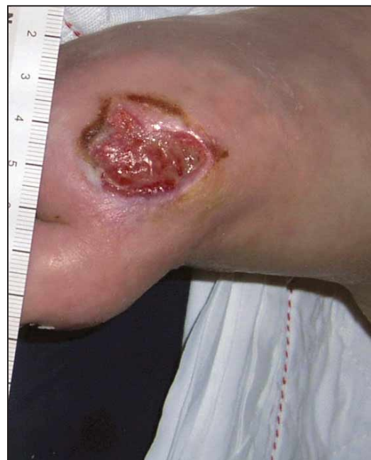
This wound on the left foot of a 93-year-old woman had not healed for more than 1 year.