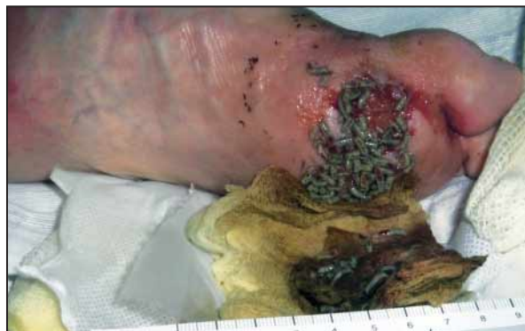
Medical maggots ( Phaenicia sericata , or green blowfly) are visible on the wound during treatment.