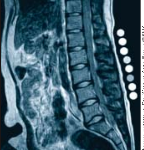
The two worst positions: MR images show that disc height was most diminished among those slouching forward (left) and those sitting perfectly upright at 90 degrees.

The 135-degree position has found its way into seat designs for luxury auto manufacturers. But until furniture makers take note, Dr. Bashir advocates the use of adjustable desks and chairs, and footrests.