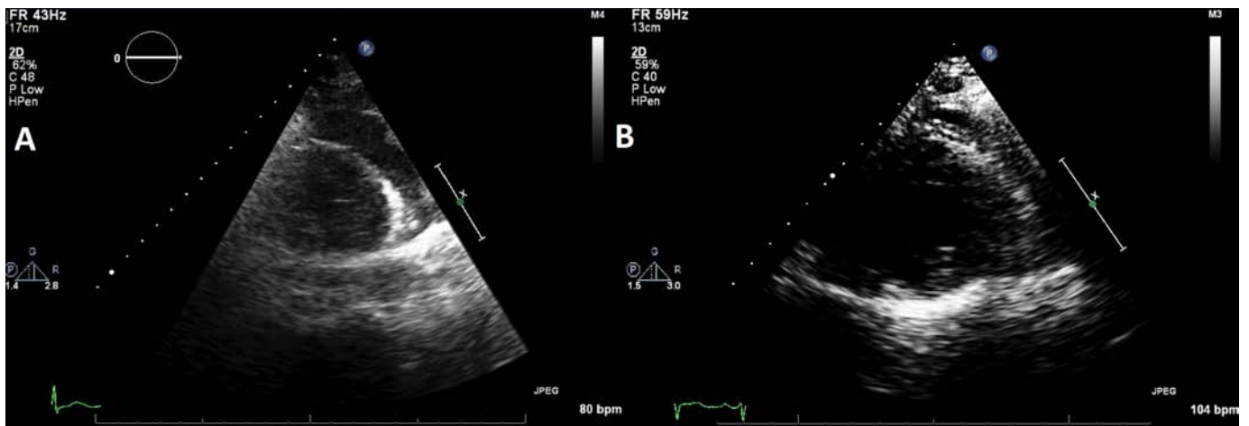
FIGURE 2 Parasternal short-axis view showing pericardial effusion: A, On admission; B, 15 days after first cycle of chemotherapy.