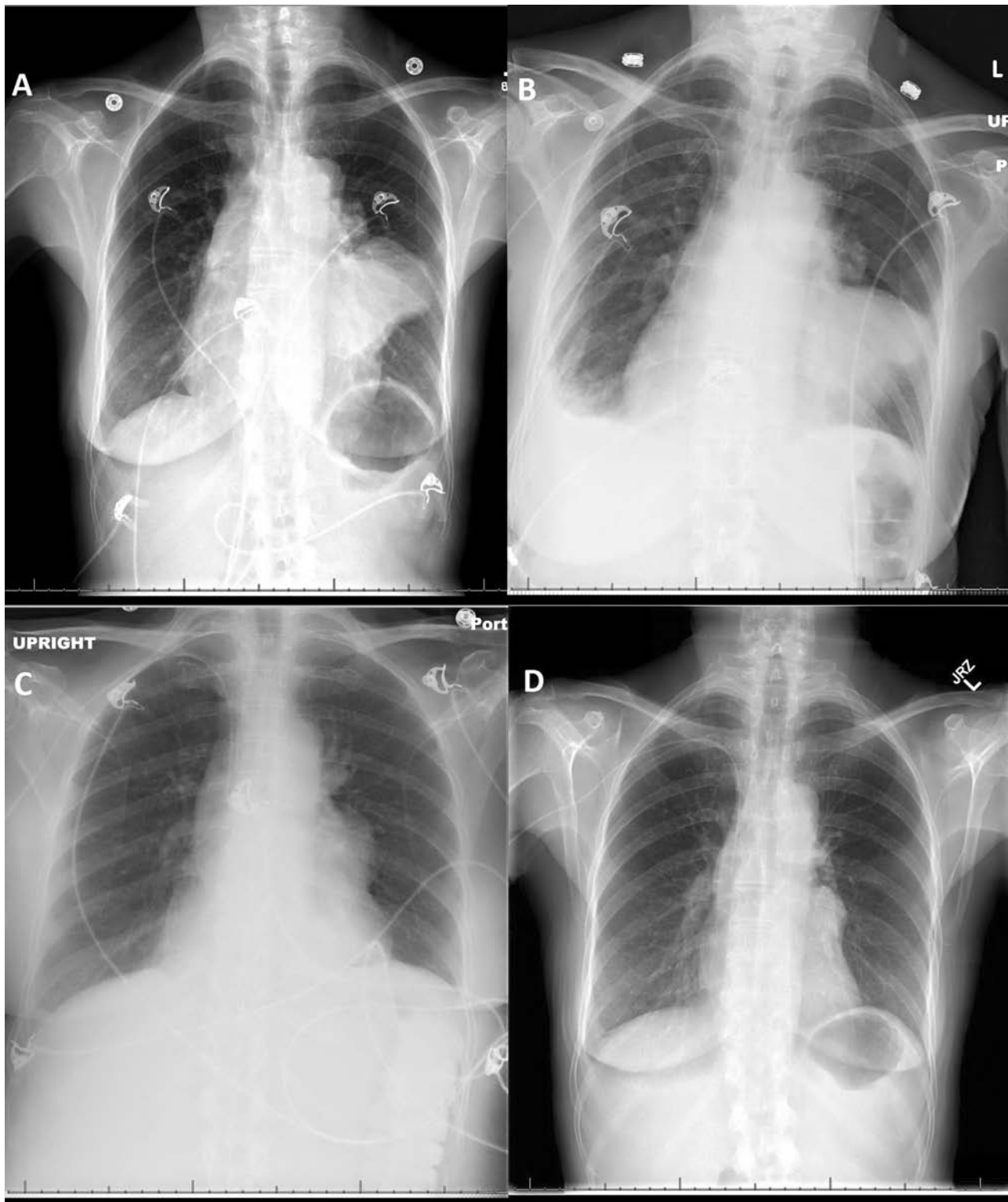
FIGURE 1 Chest roentgenogram: A, On admission; B, Day of initiation of chemotherapy; C, 7 days after first cycle of chemotherapy; and D, 2 months after first cycle of chemotherapy.