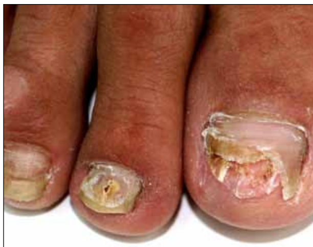
Figure 1. Onycholysis and onychodystrophy affecting the toes.

20% to 40% of all onychopathies and approximately 30% of cutaneous mycotic infections. 1,2 There are many methods available to confirm the clinical diagnosis of onychomycosis by detecting the causative organisms. Direct microscopic examination of the scraping with a KOH culture, histopathologic assessment with periodic acid-Schiff staining, immunofluorescence analysis with calcofluor white staining, enzyme analysis, and polymerase chain reaction can be used for diagnosis of fungal infections. The most frequently used diagnostic method for onychomycosis