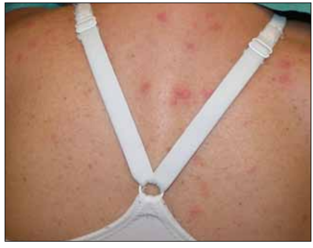
Figure 1. Scattered erythematous vesicular papules and plaques on the upper back.

Dermatology was consulted to evaluate the patient's nonpruritic vesicular rash that had been present for 6 days. Examination revealed multiple erythematous papules and plaques with vesicles rimming the periphery or studded throughout the lesions (Figures 1 and 2). Tender ecchymotic subcutaneous nodules of the lower extremities consistent with erythema nodosum also were present. Punch biopsies taken from vesicular papules of the back showed superficial perivascular inflammation and vesiculation within the epidermis (Figure 3). Polymerase chain reaction analysis revealed F tularensis . The patient was discharged with continued improvement after completion of the 1-month antibiotic regimen.