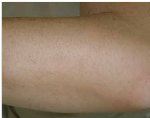
Figure 1. Subcutaneous nodule on the left forearm.

The most characteristic clinical picture of this disorder consists of the presence of multiple painless, firm, mobile nodules located on the extremities, most frequently the arms. However, other sites such as the trunk, buttocks, groin, head, face, and neck also have been reported. 2,3