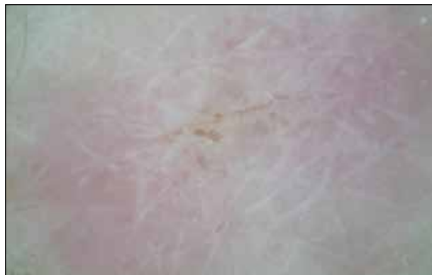
Figure 1. A patch of erythema with early central vesiculation.

Treatment generally includes the use of topical and oral steroids. 2,5 Fetal risks associated with the disease include premature birth and low birth weight. 2,3 Our patient initially was started on a 1-mg/kg dose of oral prednisone and topical steroid (prednisone 60 mg in a tapering dose every 5 days); she showed a good response at 1-week follow-up. She was well controlled with a lower maintenance