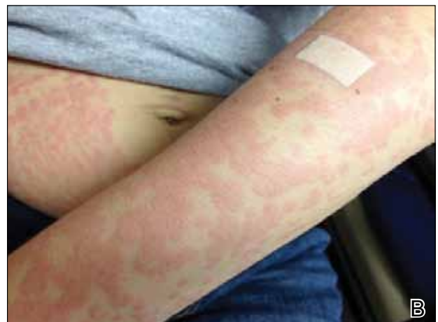
Figure 1. Initial presentation of urticarial plaques involving the abdominal striae with periumbilical sparing (A) and the left arm (B).