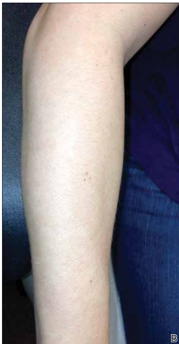
Figure 4. Complete resolution of the eruption on the abdomen (A) and the left arm (B) at 2-week follow-up.