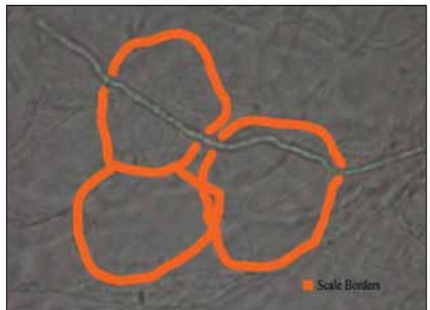
Figure 5. Example of hyphum crossing epithelial cell borders.