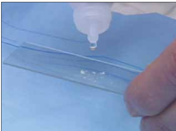
Figure 2. Adding 10% potassium hydroxide solution to skin samples.