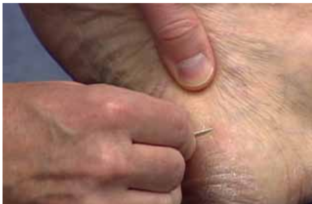
Figure 1. Scraping at leading edge of lesion with a no. 15 scalpel blade after cleaning the area with an alcohol pad.

The first step in teaching the KOH preparation to a large group is the collection of a suitable number of skin scrapings from patients with a superficial fungal skin infection (eg, tinea corporis, tinea versicolor). A common technique for obtaining skin samples is to use a no. 15 scalpel blade (Figure 1) to scrape the scale of the lesion at its scaly border once the area is moistened with an alcohol pad or soap and water. 7 The moisture from the alcohol pad allows the scale to stick to the no. 15 blade, facilitating collection. Once a suitable amount of scale is collected, it is placed on a glass microscope slide by smearing the scale from the blade onto the slide. This process has been modified to facilitate a larger quantity of specimen as follows: dermatophyte-infected plaques with scale are rubbed with the no. 15 blade and the free