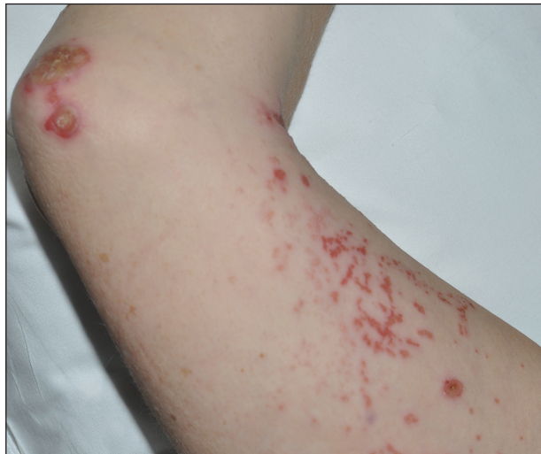
Figure 1. Psoriasiform plaques on the right arm.

Histopathology of AAE skin lesions is similar to other nutritional deficiencies. Early changes are more specific to deficiency dermatitis and include cytoplasmic pallor and ballooning degeneration of keratinocytes in the stratum spinosum and granulosum. 9 Necrosis results in confluent keratinocyte necrosis developing into subcorneal bulla. Later in the disease course, the presentation becomes psoriasiform with keratinocyte dyskeratosis and confluent parakeratosis 10 (Figure 2). Dermal edema with dilated tortuous vessels and a neutrophilic infiltrate may be present throughout disease progression.