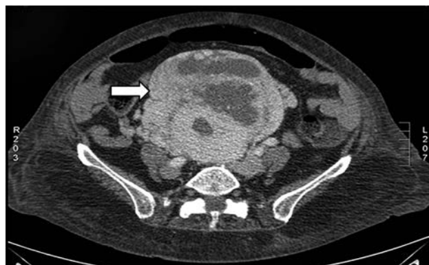
FIGURE 1 A large heterogeneous mass extending from the pelvis into the upper abdomen in the midline measuring about 20 x 13 x 14 cm. This contains cystic or necrotic areas.

An exploratory laparotomy revealed the pelvic mass with prominent vascularity, so surgical resection was not performed to avoid increased risk of bleeding, and a biopsy of the mass was done with caution. Following the biopsy, a histopathologic diagnosis of spindle cell neoplasm was made. The features were most consistent with solitary fibrous tumor (Figure 2), which further confirmed the diagnosis of NICTH secondary to a large pelvic solitary fibrous tumor. Subsequently, the patient was started on oral prednisone 20 mg daily that prevented further hypoglycemic episodes. Although she was sent