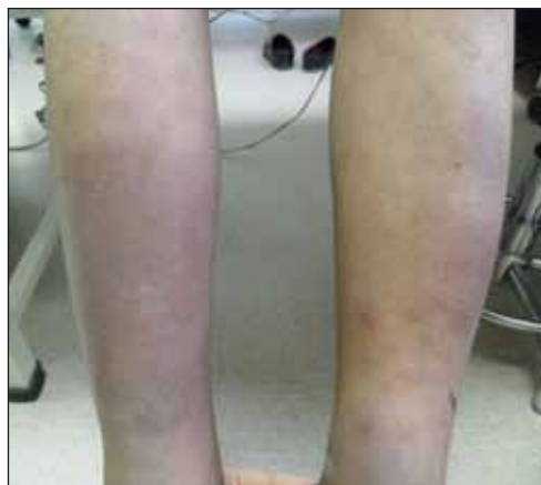
A week after his initial visit for lesions on his scalp, our patient developed tender, erythematous nodules on the anterior surface of his lower legs.