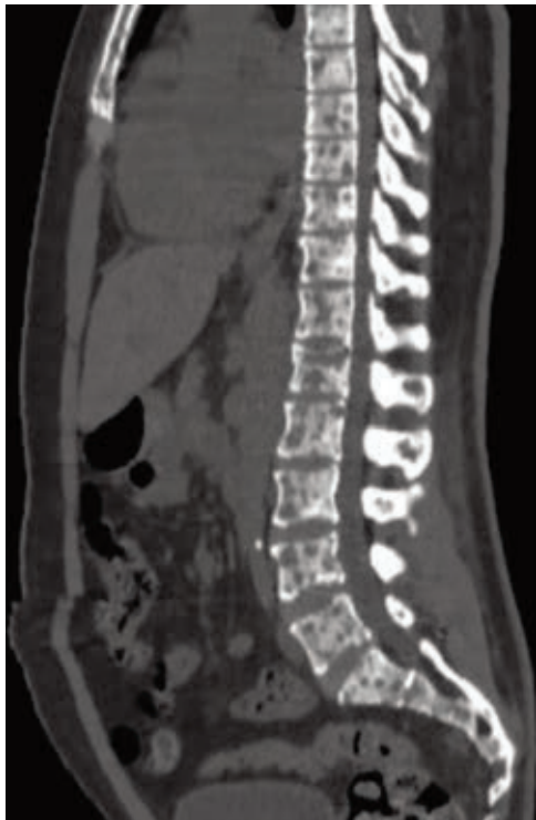
FIGURE 1 Computed-tomographic scan of the sagittal section view of the chest, abdomen, and pelvis showing innumerable osteolytic lesions in the vertebral bodies.

antigen, beta-human chorionic gonadotropin, alpha-feto-protein, lactate dehydrogenase, and thyroid function tests were nonrevealing.