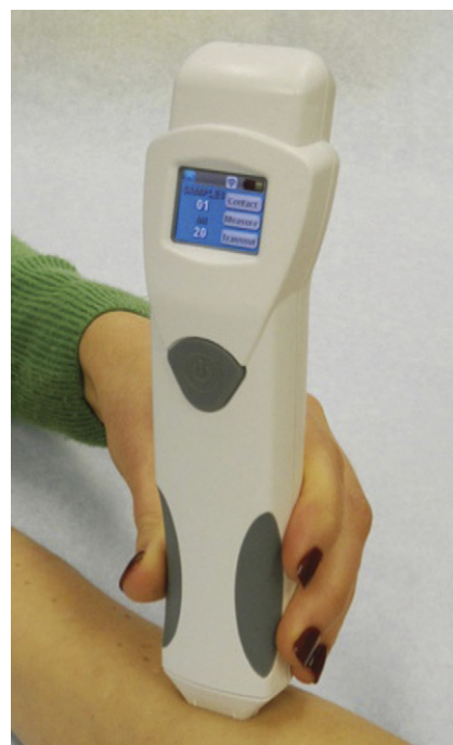
Figure 4 Skintel pigment meter in action—the device reports a value between 10 and 100.

Objective tools to examine the skin condition are other additions to the laser and IPL arsenal. These measurements should aid in selecting optimal settings for wavelength ranges where the epidermis is heated. For example, most laser surgeons concede that “eyeball” assessment of background epidermal melanin content is inconsistent and often inaccurate. Overestimation leads to unnecessarily conservative settings and disappointing results; underestimation leads to excessive settings that can result in vesiculation and even scarring. In our daily practice, we evaluated the predictive value of real-time Melanin Index (MI) measurements (Skintel, Palomar Medical, Burlington, MA) for determining appropriate IPL treatment settings across 5 treatment centers. The goal was to identify a starting point fluence setting that was at or just below the optimal treatment settings. Because skin tolerance is predicted to be related to melanin content, then real-time measurement of melanin should make it possible to accurately predict appropriate treatment settings. Pulse width and