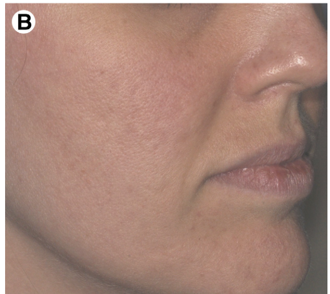
Figure 3 (A) Pretreatment RF pixel acne scar. (B) 3 months after 1 treatment.

future, expect to see other light-based technologies that inactivate fungus and bacteria through photothermal or photochemical means.