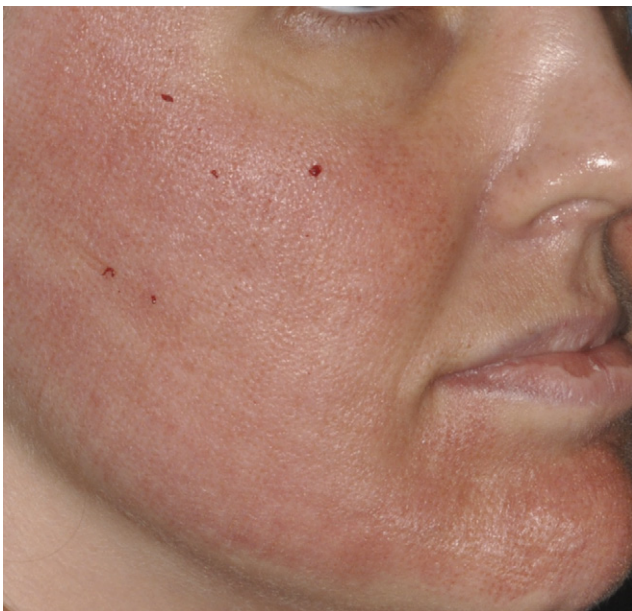
Figure 2 Patient just after treatment with roller RF device—note microwounds about 200 \mu m in diameter.

where the patient reports a “warm” sensation. Another laser uses 870 nm and 930 nm light. 33 They found that after 4- and 2-minute exposures (in the same office visit) which were carried out 4 times at roughly monthly intervals, 75% of the nail cultures had cleared. They used infrared (IR) thermometers to maintain temperature (T) at 102°F (39°C) at a laser power density of 1 W/cm 2 . Other lasers have been applied, but no published peer-reviewed studies compare laser with conventional medical approaches. One popular system is the PinPointe laser, a device that uses 1064 nm to gently heat the nails. In the