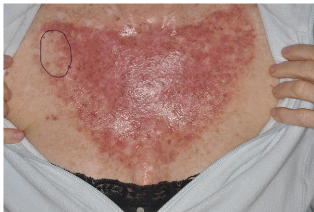
Figure 6 Patient 5 days after ALA PDT after pretreatment with fractional erbium laser. The reaction occurred after only a 30-minute incubation period—note the circled area was not pretreated with the fractional laser and shows little response.

The increasing miniaturization of devices has allowed for home use in a range of applications. Multiple home hair-removal devices are available as are light-emitting diode panels for acne. Any home-based therapy must overcome eye safety issues. Typically this is achieved by not allowing the laser to fire unless in contact with the skin. With “home” fractional lasers, overtreatment risks are decreased by time limiting the number of total pulses in any given time period. Leyden et al 42 evaluated the safety and efficacy of a novel