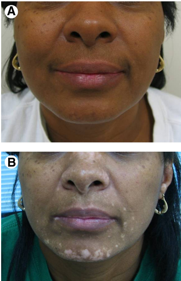
Figure 1 Vitiligo before (A) and after (B) phototherapy.

have a severe impact on day-to-day life, especially in areas of the world where ignorance of the disease is widespread. It affects approximately 1% of the population of the United States, with varying rates worldwide. 33