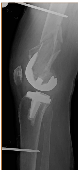
Figure 2. Lateral radiograph of knee immediately after application of spanning uniplanar external fixator.

The procedure was performed with the patient under general anesthesia. During surgery, a lateral image of the femur was used to identify the distal end of the THA prosthesis. A level was marked 2 to 3 cm distal to the tip of this prosthesis, and another about 1 cm above the fracture (noted to be above the most proximal extent of the knee joint). These planned pin-entry sites were prepared from an anterior approach with incisions (using a No. 11 blade) of about 1 cm each. Blunt dissection was carried down to the femur. Each planned pin site was predrilled with a 3.5-mm drill; then, a 5-mm Shanz pin was