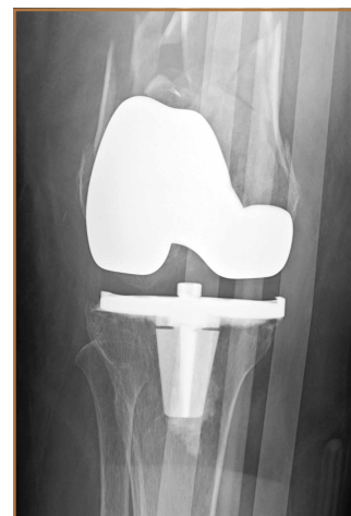
Figure 1. Anteroposterior radiograph of knee in immobilizer brace immediately after periprosthetic fracture.

Authors' Disclosure Statement: The authors report no actual or potential conflict of interest in relation to this article.