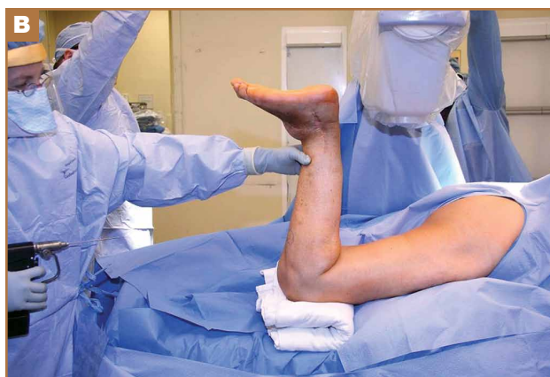
Figure 2. Clinical photographs: (A) anteroposterior view, (B) lateral view. Ipsilateral extremity is prepared and draped with complete access to entire femur. Note large anteromedial free flap, which requires trans-Achilles posterior approach to avoid tenuous blood supply.