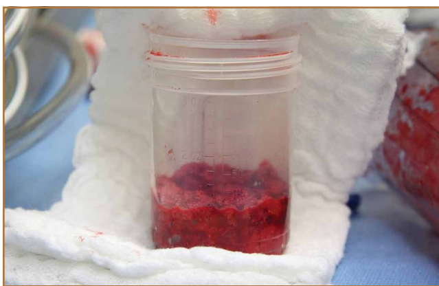
Figure 4. Specimen cup of bone graft (~30 mL) harvested from intramedullary canal after removal of supernatant fluid.

intramedullary debris. Typically there is no debris, as it is captured by the RIA. The wound is closed in 2 layers. Dressing with Ace bandage (3M, St. Paul, Minnesota) is placed around the knee for comfort. Weight-bearing status is determined by the index procedure.