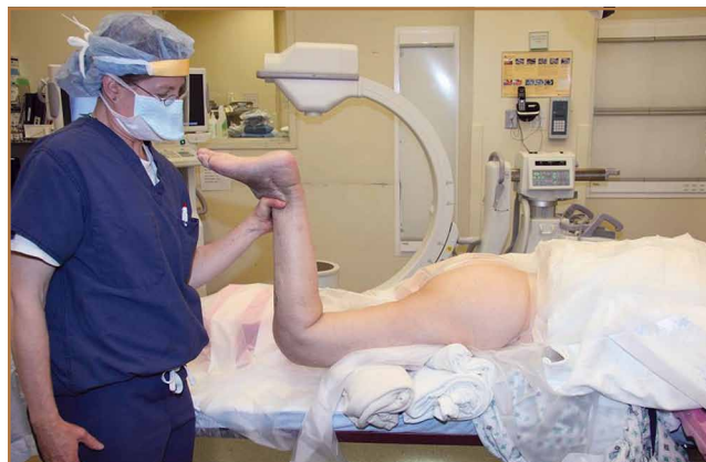
Figure 1. Clinical photograph shows prone positioning of patient on radiolucent table.

The knee joint is irrigated to remove any