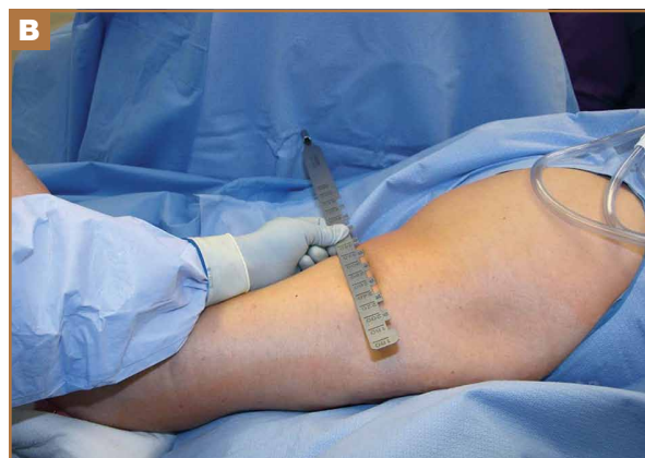
Figure 3. (A) Fluoroscopic C-arm image of radiolucent ruler over femoral isthmus. (B) Clinical photograph shows placement of radiolucent ruler over posterior thigh.