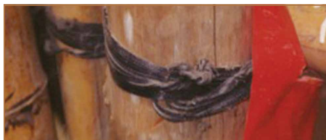
Figure 2. Lashings that secured bamboo poles of Hong Kong scaffolding had no knots but were secured by turning back on themselves and wrapping in a knotless manner. Reprinted from Arthroscopy: The Journal of Arthroscopic & Related Surgery , volume 19, Stephen S. Burkhart, Kiriacos A. Athanasiou, The twist-lock concept of tissue transport and suture fixation without knots: observations along the Hong Kong skyline, pages 613-625, Copyright 2003, with permission from Elsevier.

ciation. My first view of the magnificent Hong Kong skyline across Victoria Harbour was truly breathtaking. As I admired the gleaming glass towers and the concrete canyons of the city, I had no idea that the very next day these modern skyscrapers would reveal an ancient secret that would change my approach to arthroscopic rotator cuff repair.