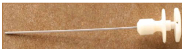
Figure 1. Spring-loaded retrograde suture passer (Arthrex) with straight tubular shape necessitated by degree of difficulty inherent in trying to fabricate more complex shapes in early 1990s.

In November 1998, I made my first trip to China as a guest speaker at the Congress of the Hong Kong Orthopaedic Asso-