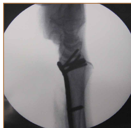
Figure 5. Lateral fluoroscopy shows appropriately placed screws with bicortical fixation.