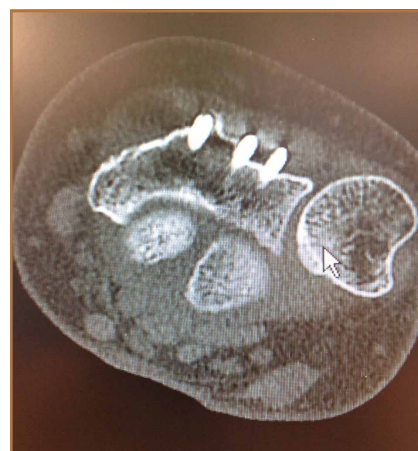
Figure 2. Computed tomography shows dorsal screw penetration at ulnar side of distal radius of patient referred for second opinion for dorsal wrist pain.