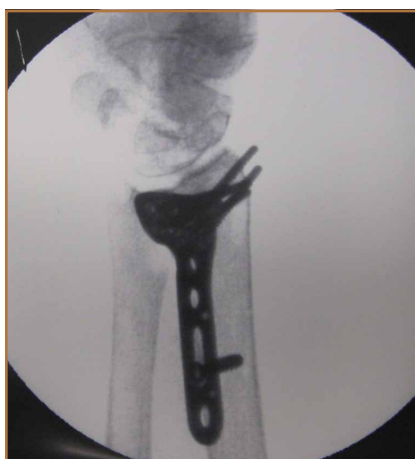
Figure 6. Supinated view (45°) shows prominence on dorsal radial styloid.

We wanted to identify high-risk areas and estimate expected dorsal screw prominence in order to make appropriate intra-