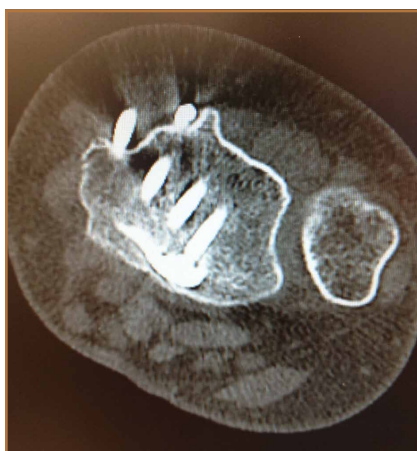
Figure 1. Computed tomography shows dorsal screw penetration at radial styloid of patient referred for second opinion for dorsal wrist pain.

Mean (SD) dorsal prominence at each screw position was calculated. The screws were also categorized into radial (1,4), central (2,5), and ulnar (3,6,7) groups based