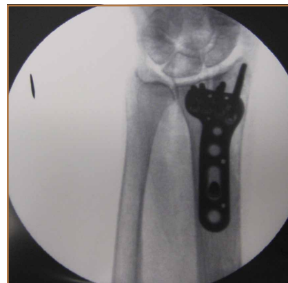
Figure 4. Anteroposterior fluoroscopy shows appropriately placed screws with bicortical fixation.