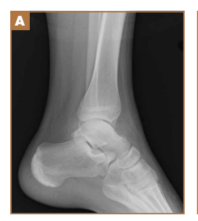
Figure 1. (A) Lateral radiograph shows a cystic mass, located at the dorsal aspect of the talar neck. (B) Anteroposterior radiograph shows normal findings.

A 13-year-old boy presented to our clinic 3 months after a right ankle sprain. He had visited the emergency department