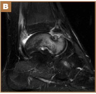
Figure 3. (A) Noncontrast coronal T1-weighted magnetic resonance imaging (MRI) shows a round ossicle overlying the superior margin of the neck of talus. (B) Noncontrast T2-weighted fat-saturated MRI shows a round ossicle overlying the superior margin of the neck of talus with surrounding edema.