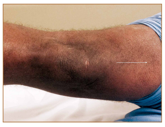
Figure 1. Right knee of patient in left lateral decubitus position. Leg is passively abducted by examiner with quadriceps relaxed and knee extended. With active quadriceps contraction (white arrow), patella is pulled back into trochlea. This is the negative gravity subluxation test.

Furthermore, the attachments of the LPFL and the orientation of its fibers suggest that the LPFL may have a significant role in limiting medial excursion of the patella. Vieira and colleagues<sup>23</sup> resected the LPFL in 10 fresh cadaver knees. They noticed that, after resection, the patella spontaneously traveled medially, demonstrating the importance of this ligament in patellar stability. In cases of isolated MPS, there have been no reports of associated pathology, such as muscular imbalance