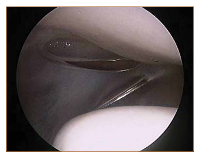
Figure 4. Arthroscopic picture of patellofemoral compartment (right knee) viewed from anterolateral portal shows lateral patellar laxity at full knee extension.

Once MPS is suspected after a thorough history and physical examination, examination under anesthesia accompanied by diagnostic arthroscopy confirms the diagnosis. Lateral forces are applied to the patella in full knee extension and 30° of flexion (Figure 3). During arthroscopy, the patellofemoral compartment is viewed from the anterolateral portal. With the knee at full extension, the lateral laxity and medial tilt of the patella can be identified (Figure 4). As the knee is flexed