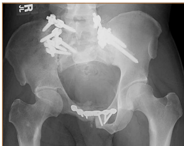
Figure 2. Postoperative radiograph of the pelvis shows fixation of the sacroiliac joints bilaterally and the pubic symphysis. Note the complete absence of the right inferior pubic ramus and ischium. There is partial destruction of the right acetabulum.

Now age 30 years, the patient ambulated only with crutches and endorsed minimal improvement in his pain over 3 years of treatment. Physical examination of the patient revealed that he was a tall, thin man in visible discomfort. Sensation was intact to light touch in the bilateral L1 to S1 nerve distributions. There was marked weakness of the right lower extremity, and his examination was limited by pain. He could not perform a