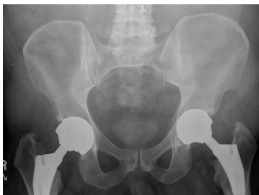
Figure 1. Anteroposterior pelvis upon presentation, prior to revision. No evidence of loosening or hardware failure is present.

proceed with revision of the MOM components.