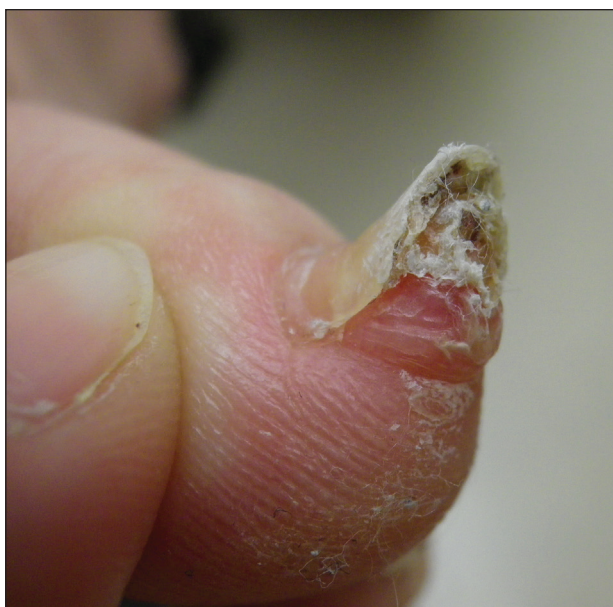
Figure 1. A 1-cm firm, hyperkeratotic subungual papule on the right third toe.

A shave biopsy was obtained of the visible portion of the lesion, which revealed hyperkeratosis, acanthosis, and a population of dermal spindle cells in a myxoid stroma that could not be definitively identified. Special stains were nondiagnostic. The patient was referred to dermatologic surgery for