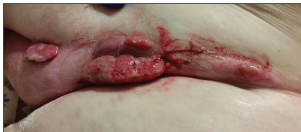
FIGURE 1. Metastatic endometrial carcinoma. Large, friable, exophytic tumors of the lower abdominal panniculus.

Incidence and Pathogenesis —Endometrial carcinoma is the most common gynecologic malignancy in the United States,