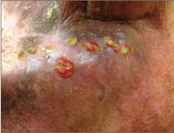
FIGURE 2. Four discrete lesions measuring 4 to 7 mm in diameter on the right clavicle 1 week after the initial presentation.

the right tonsil and soft-palate carcinoma with radical neck dissection and postoperative radiation, which was completed approximately 4 years prior to placement of the metal plate. The patient recently completed 4 to 6 weeks of fluorouracil for shave biopsy-proven actinic keratosis overlying the entire irradiated area.