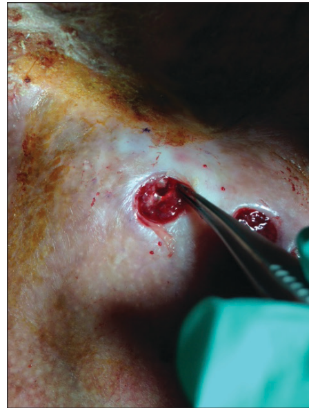
FIGURE 3. Underlying loosened orthopedic hardware screws were revealed upon punch biopsy.

Underlying loosened orthopedic hardware screws were revealed upon punch biopsies of the involved areas (Figure 3). Wound cultures showed abundant Staphylococcus aureus and moderate group B Streptococcus ; cultures for Mycobacterium were negative. The C-reactive protein level was elevated (5.47 mg/dL [reference range, \leq 0.7 mg/dL]), and the erythrocyte sedimentation rate was increased (68 mm/h [reference range, 0–15 mm/h]). A complete blood cell count was within reference range, except for a mildly elevated eosinophil count (6.7% [reference range, 0%–5%]). The patient was admitted to the